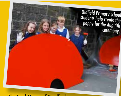
Oldfield Primary school students help create the poppy for the Aug 4th ceremony.

Oldfield Primary School has been the first of the local schools to participate in preparing a sign, which includes a giant poppy to commemorate the 100 years since the outbreak of The Great War.