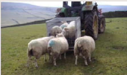
Spot the Ewes

One lucky tup will have around 30 females to himself to serve in the next few weeks. We used to have one who's pedigree name was "Busy Boy" - quite appropriate wouldn't