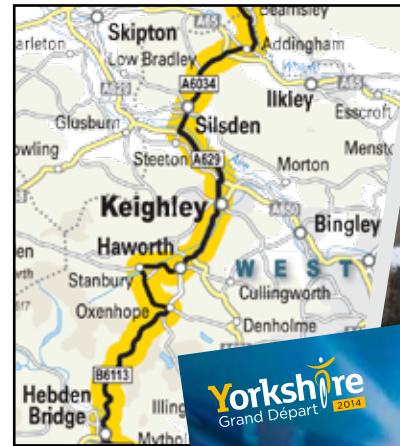
Detail of Stage 2 TDF2014 route through Worth & Aire Valleys, West Yorkshire.