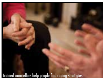
Trained counsellors help people find coping strategies.

Vivien Wallwork Counselling www.free-myself.com 01535 642815