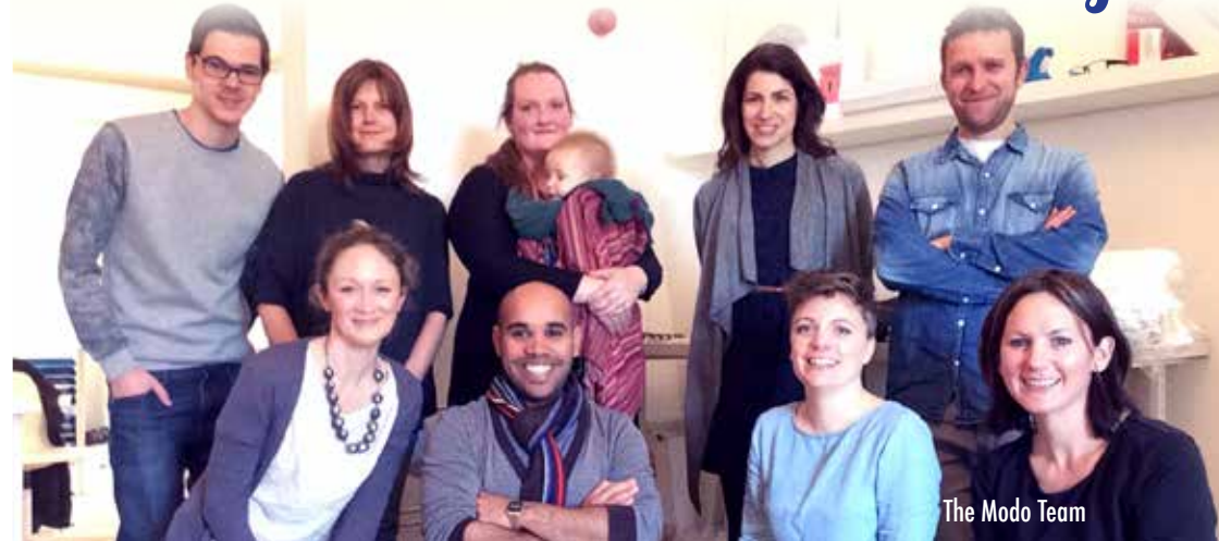
The Modoworks Team