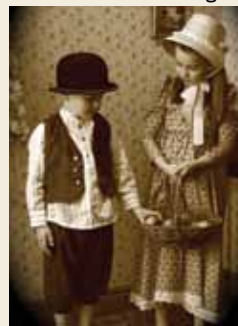
Children's Heritage portraits make a unique gift.

Utun is the master photographer with a creative eye and Ruth has the flair and vision to bring the whole experience