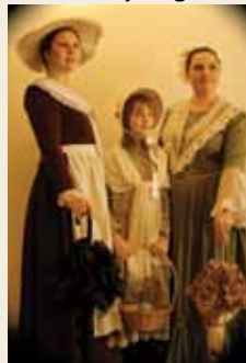
Choose from country casual to aristocratic costumes

"Dressing up for grown ups" is how one client described the hour spent at Haworth Heritage Portraits one afternoon. You can step back in time, wrap yourself in period costume and imagine yourself living another life. It is escapism at its very best... and then you get a lovely photo that