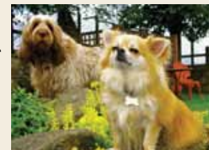
Capture your canine or feline friends with a unique pet portrait

In addition to the period portraits, Utun and Ruth can undertake more traditional style portraits either in the studio, at your home, or on location in the beautiful surrounding valleys.