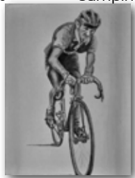
Illustration by Frank O'Dwyer